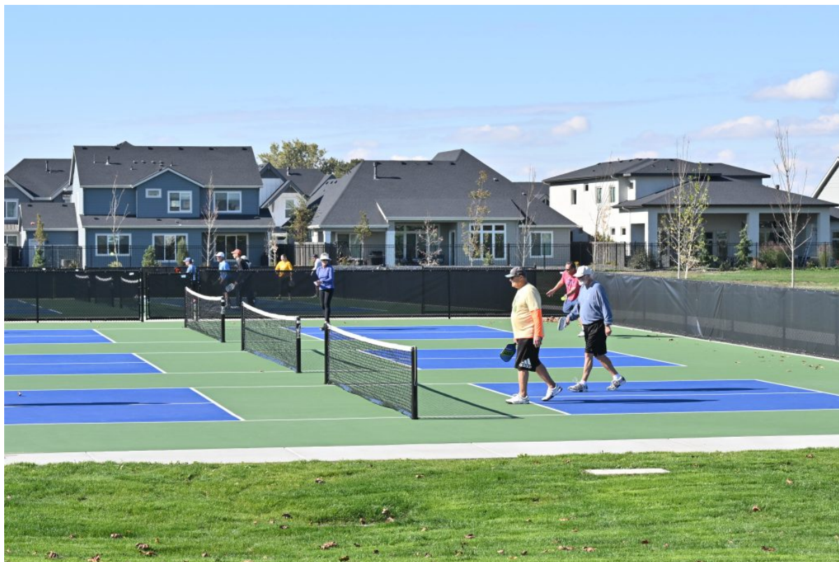
New Pickleball Courts at Discovery Park with Pinnacle Community in the background.