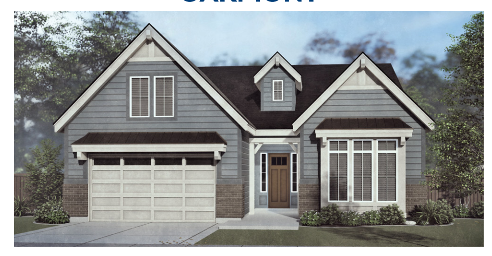
3 Beds | 3 Baths | Bonus Room | 2 Car Garage | 2,500 SQFT