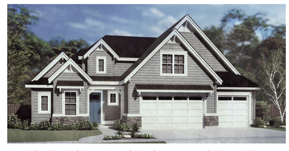
4 Beds | 3.5 Baths | Bonus Room | Den | 3 Car Garage | 2,780 SQFT

© Brighton Corporation 2022. Brighton reserves the right to make changes or modifications to any plans, specifications, materials, features and colors without notice. Plans, landscaping and interior or exterior renderings are artist's conceptions, are not to scale, and may not accurately depict the buildings or other structures, the homes or lots as they are built. Landscaping, fencing, and other amenities are for display purposes only. This brochure is for illustrative purposes only and is not a part of a legal contract.