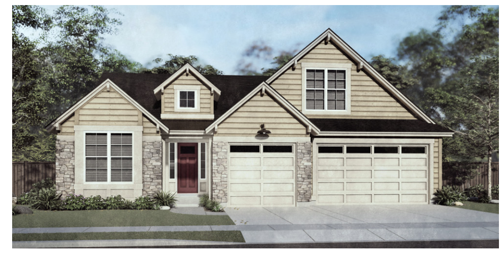
3 Beds | 2 Baths | Bonus Room | 3 Car Garage | 2,340 SQFT