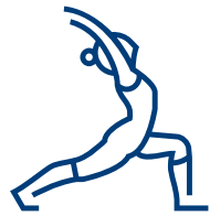
INDOOR & OUTDOOR FITNESS

Fitness Classes Classes Game Nights Club Gatherings Holiday Celebrations Teen Nights Book Club