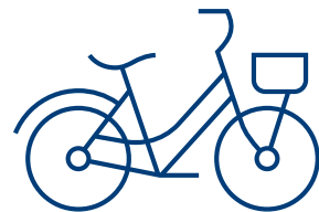
WALKING & BICYCLE PATHS

Entertainment Outdoor Fitness Yard Games Food Truck Rallies Farmer's Market